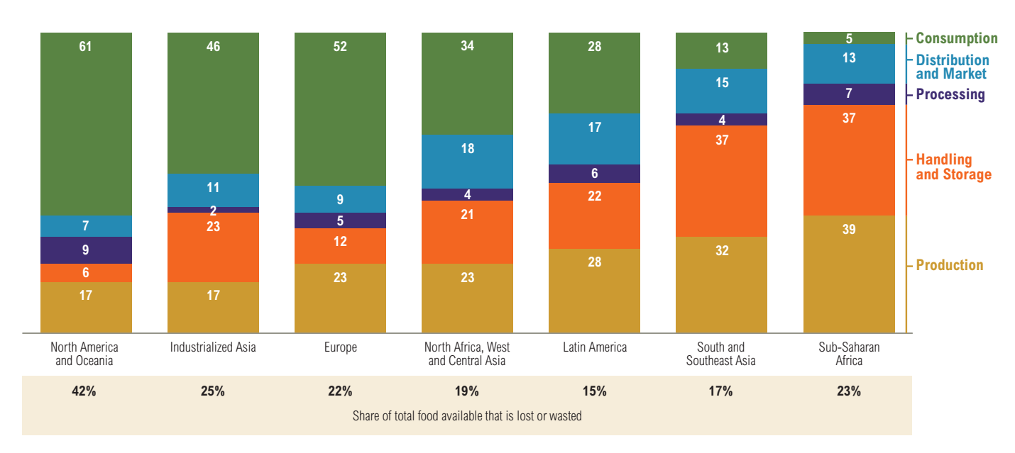
FIGURE 1. Losses near production are more prevalent in developing regions while food waste near consumption is more prevalent in developed regions (Percent of total kcal lost or wasted per region, 2009)

Note: Numbers may not sum to 100 due to rounding.