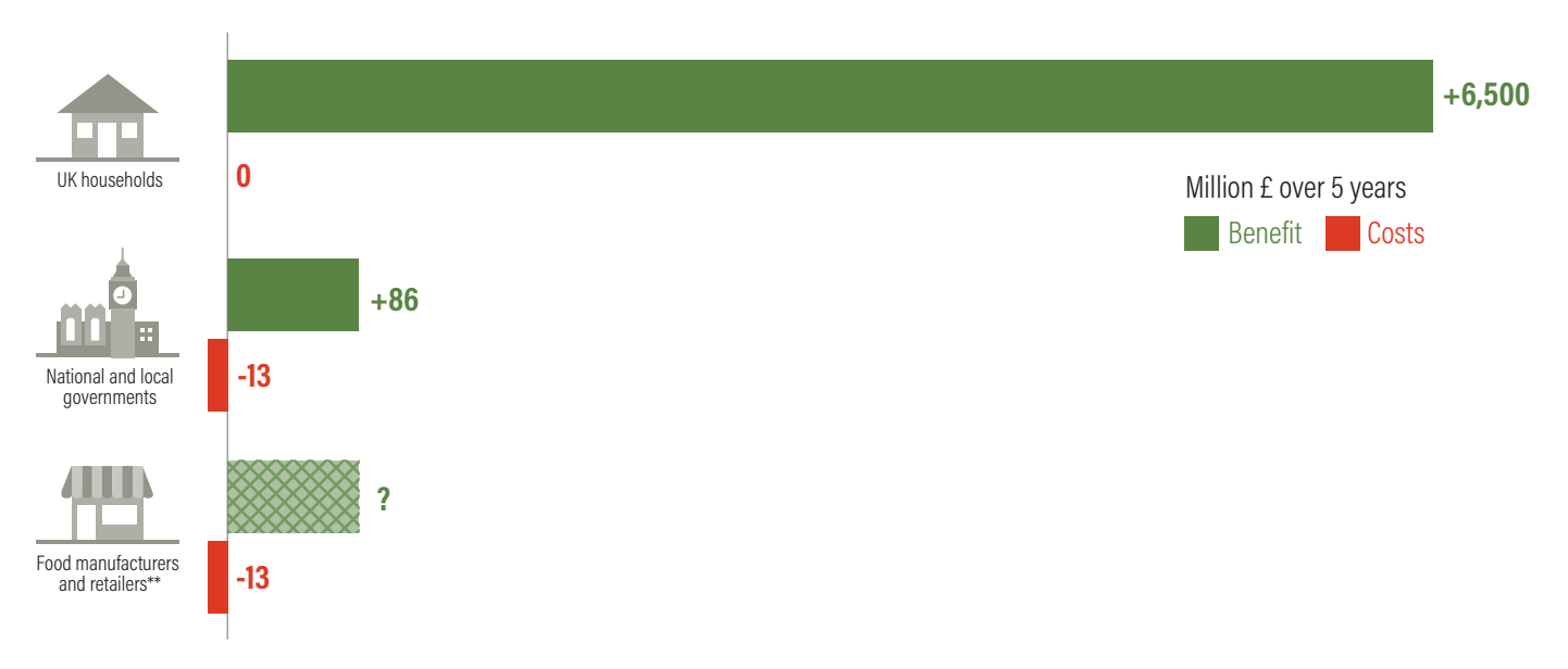
FIGURE 2. Distribution of benefits and costs: United Kingdom*