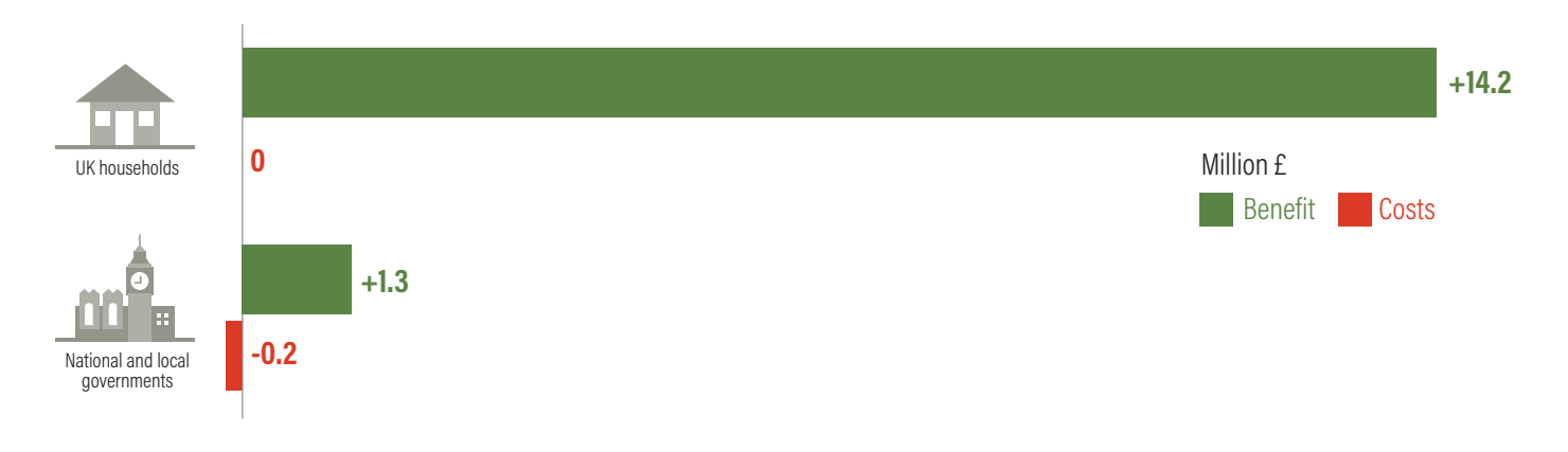
FIGURE 3. Distribution of benefits and costs: West London*